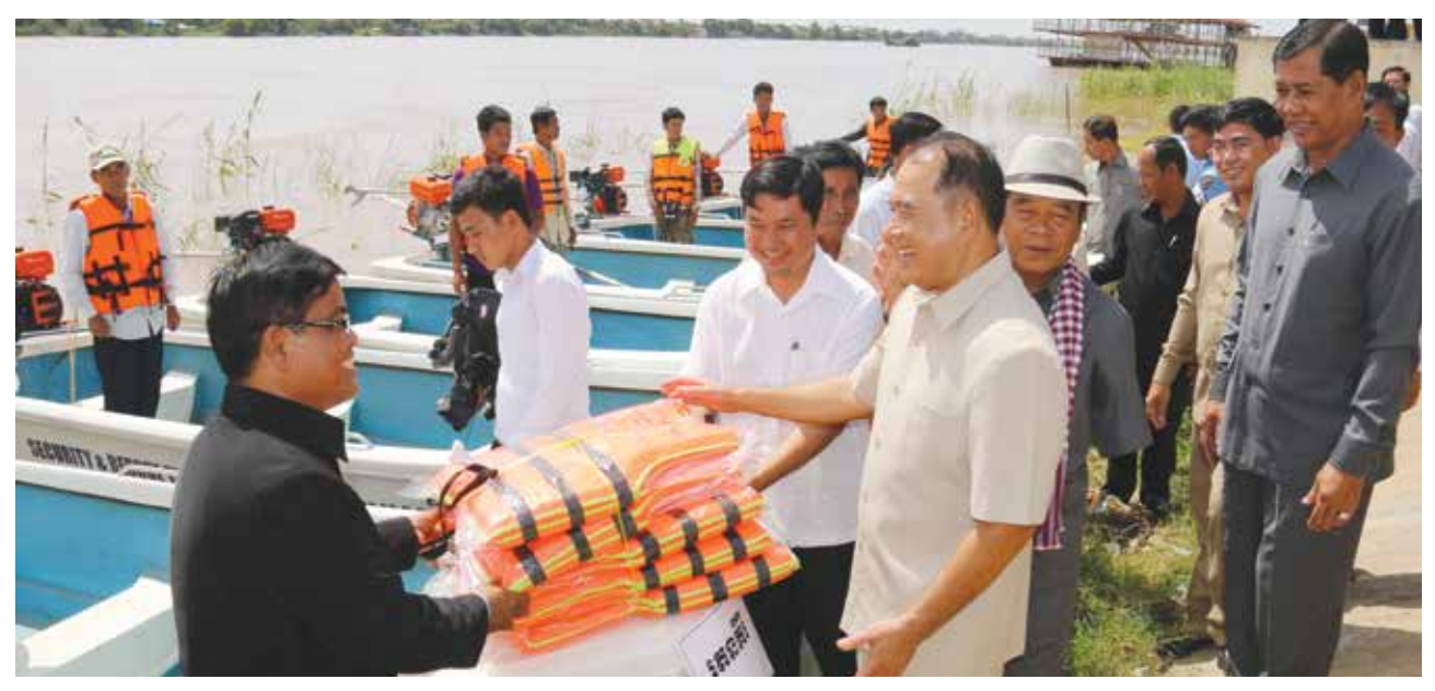
Distribution of recue boats to provincial committee for disaster management