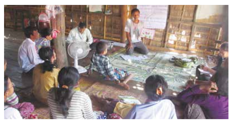
Community awareness on general health and HIV/AIDS conducted by HIV/AIDS Self-Help Group leader in Kralanh district, Siem Reap province.

Under the reporting period, Caritas implemented three major activities namely Community Based Prevention Care and Support; Livelihood and Income Generation Activities; and Vocation Training Center (Bridge of life).