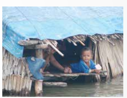
Emergency Response Preparedness and Rehabilitation