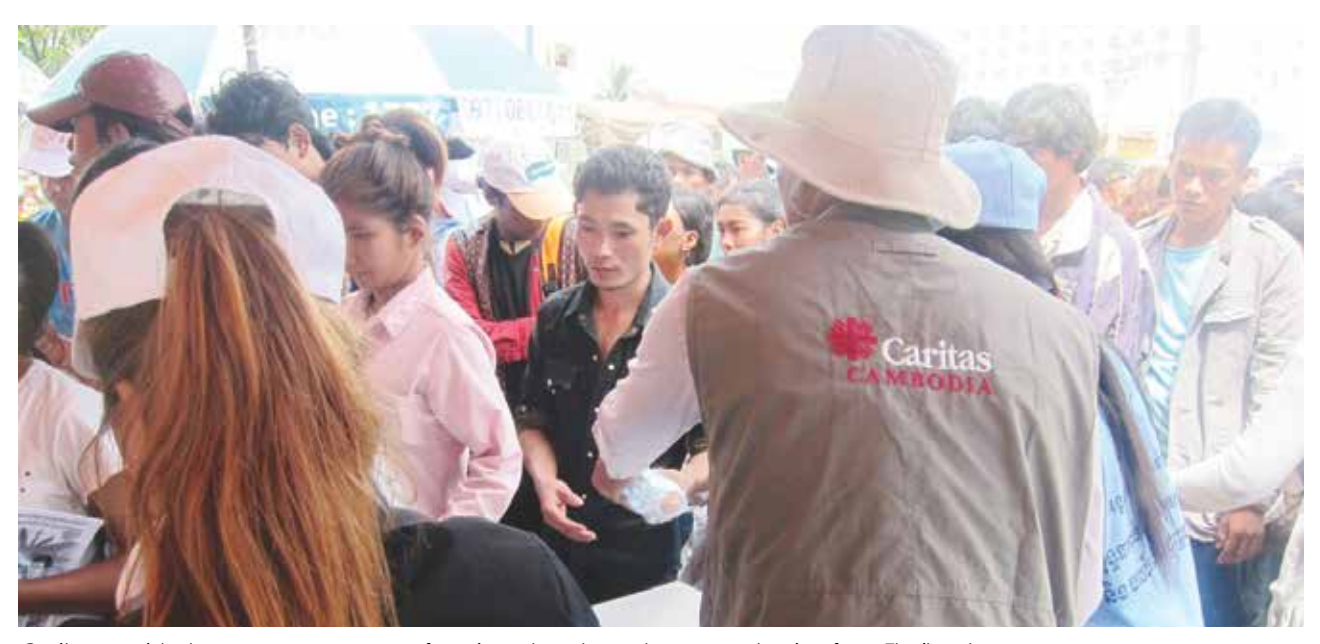
Caritas provided emergency response for migrant workers who were returning from Thailand