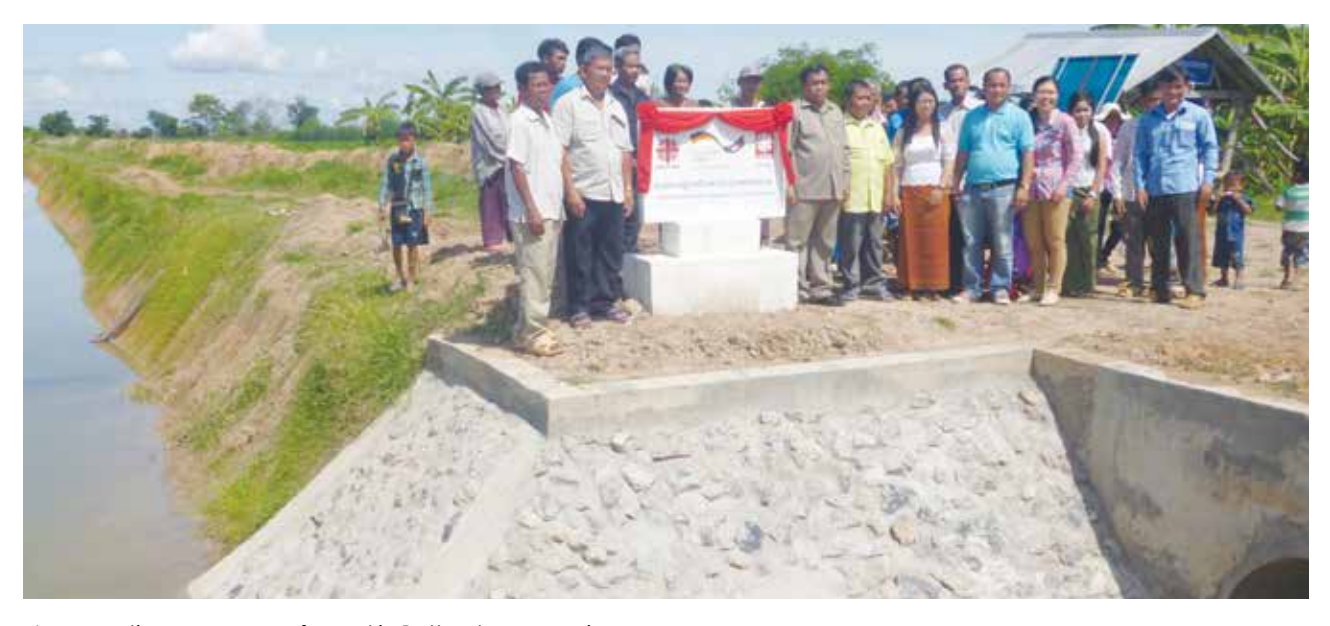
Inauguration ceremony of canal in Battambang province

To help mitigate the effects of climate change, Caritas Cambodia implemented a project "Measure for Adaptation to Climate Change", with the aims to help to strengthen the ability of Cambodia's rural population to adjust to and prepare for a future increase in climate-related disasters.