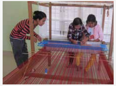
Friendly Vocational Skill Development for Women and Young Mothers with Children