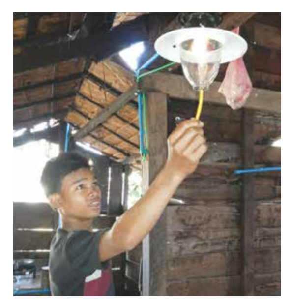
A farmer in Dambok Kpos village, Siem Reap province, generated electricity at his home from biogas.

A six- year program (2013-2018), supported by German Ministry for Economic Cooperation (BMZ), and is piloted in 10 villages in 7 provinces across the country: Kandal, Kampong Thom, Kampong Cham, Mondolkiri, Preah Vihear, Siem Reap and Battambong province.