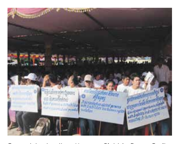
To celebrate the Human Rights' Day, Caritas Cambodia joint with civil society groups on the occasion of the International Human Rights' Day which gathered approximately 5,000 people