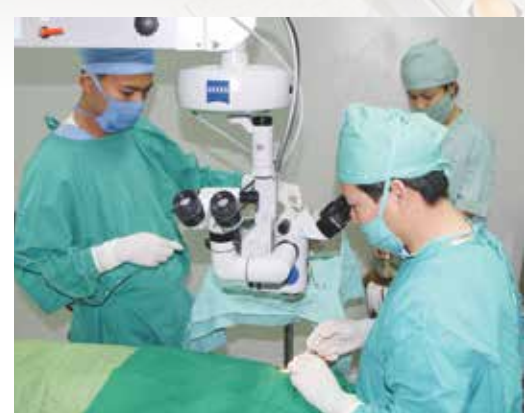
The perferment cataract operation at Caritas Takeo Eye Hospital

Caritas's Comprehensive Eye Care program has been the single largest eye care program in the country since 1997. The program which is based in the government hospital in Takeo province, works to combat blindness, restoring sights through education, counseling, treatment and surgery.