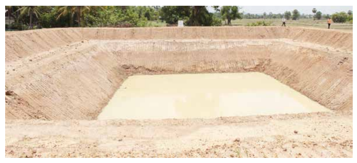
Supporting the contruction of water pond in Siem Reip province

The Community Development Programme has supported communities in infrastructure development. Caritas works to mobilize local resources and support to build, renovate community assets such as road, bridge, and canal water well, water gate and other physical infrastructures. A total of 280 small scale irrigation system including water well, solar water pump, community pond and latrines have been built and renovated.